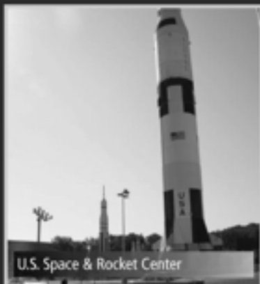
U.S. Space & Rocket Center