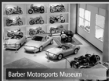
Barber Motorsports Museum