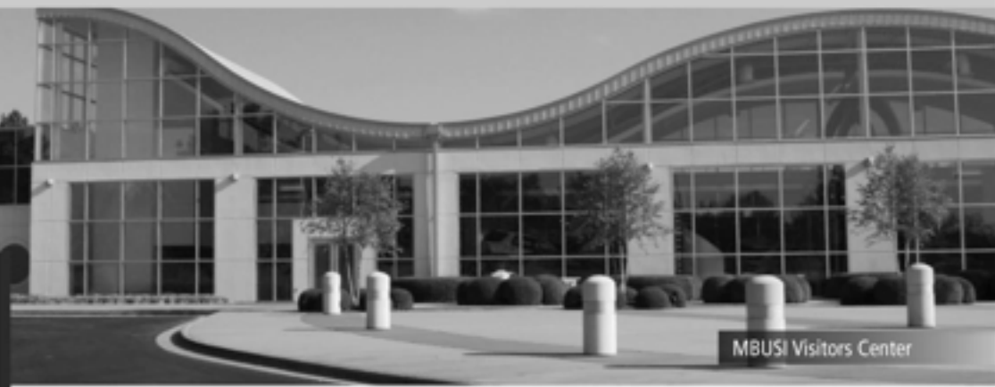
MBUSI Visitors Center