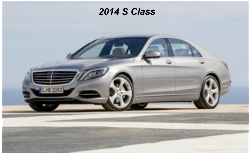
2014 S Class