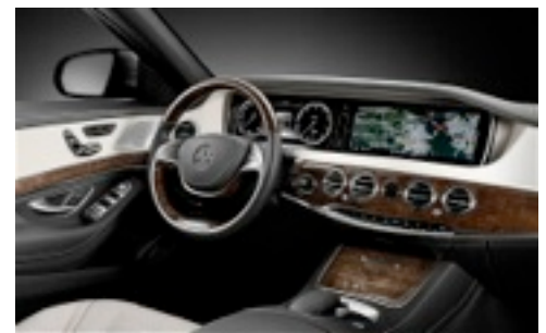
2014 CLA Class